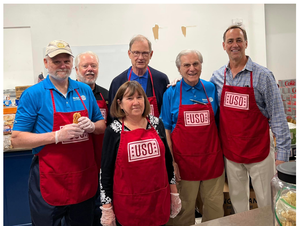
We invite all members, especially those who are new or have not yet volunteered for a Day of USO service, to consider joining us for this special opportunity to give back to our military personnel. I assure you that at the end of the day, you will feel fulfilled and appreciated by those you serve, who will respond with, "Yes Sir" or "Yes Ma'am" in heartfelt gratitude.

Event Details: Date: Thursday, April 10, 2025 Location: USO, Hartsfield Airport Shift: 9 AM to 3 PM